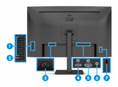
Table 1-2 Rear components and their descriptions

To identify the components on the rear of the monitor, use this illustration and table.